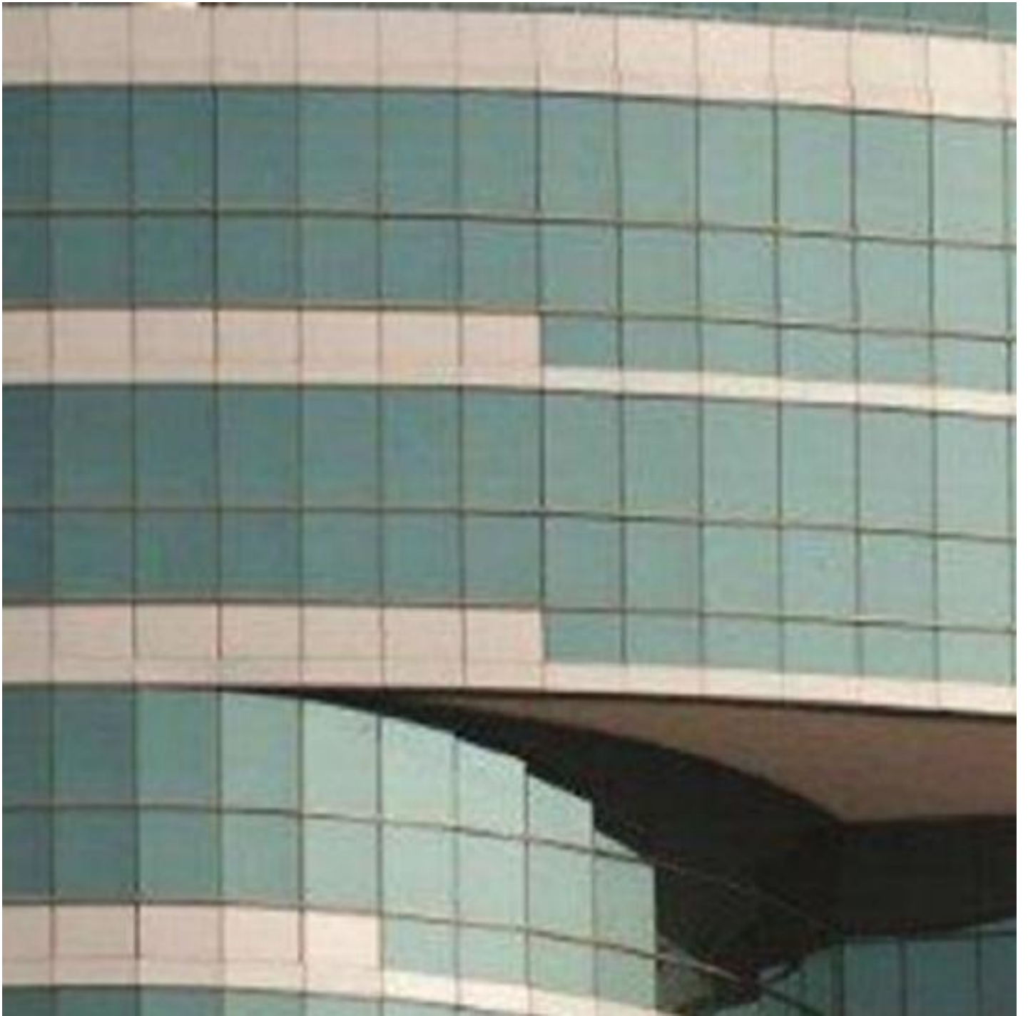
SGG Emerald Glaze