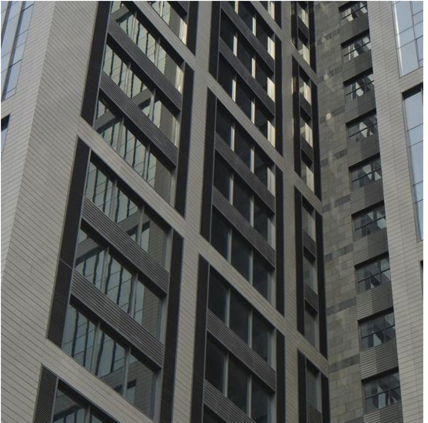
SGG Passion Green