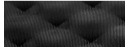
DEEP BLACK DL 227 Deep and sophisticated sensation.

For anyone who ever dreamt of combining the texture of textile and the finish of lacquered glass, the new reality is here. Meet MASTERSOFT COLOR-IT, a bright modern glass that plays with volumes and textures to bring genuine personality to any interior. This revolutionary MATELASSÉ effect is perfectly in phase with today's trends: with its three-dimensional design and colour depth, it offers uniqueness, originality and durability.