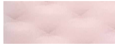
PETAL PINK DL 293 Modern colour that will spread well-being in all kinds of spaces.