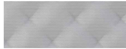
PEARL GREY DL 177 Serious, chic, elegant and sophisticated for timeless interiors.