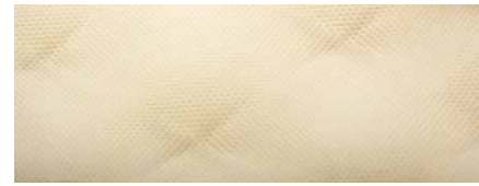
CREAM SILK DL 224 Natural soft color very much used in minimalist design.